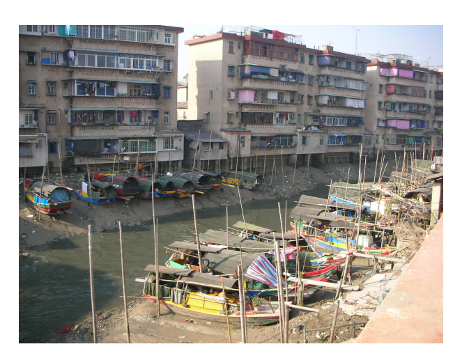
Fig 4. Apartment blocks of the Sm Fishing Shequ (2010)

This paper is based on the author's own observations during long- and short-term fieldwork conducted intermittently in the period from 2007 to 2018 with Sm Fishing Shequ as a base. For the purposes of privacy protection, in order not to be able to identify individuals, pseudonyms are used for the individuals presented here.