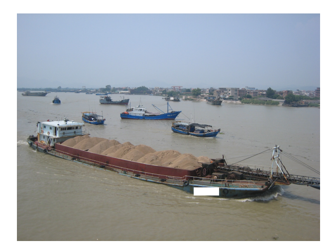
Fig 8. Sand ship