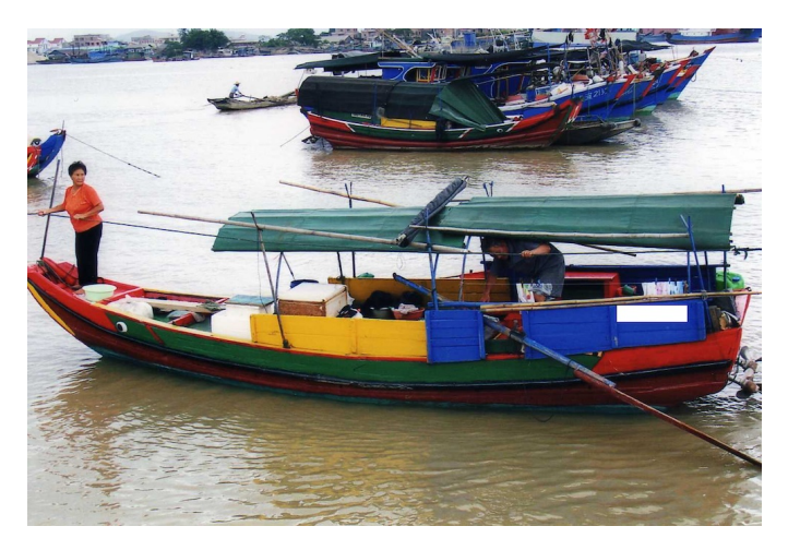
Fig 7. Used wooden boat of Zhang Yagun

Zhang Yagun and his wife purchased a small used wooden boat (total length of about 7.0m, width of about 2.1m, depth of about 0.85m) and began fishing with it (Figure 7). From the second to eleventh months on the lunar calendar they would catch conger near Xiamen Island, and during the winter catch the likes of yellow croaker and blue mackerel with a gill net. During the summer off-season (1.5 months; violators are fined), at the beginning of the year, on ancestral ritual days, and so on, they would return to their apartment. Other than that, they fish at the fishing grounds, and live a life at the berthing places (usually a space on the water a little distance from the coast where it's easy to avoid waves, with convenient access to a large port to go to markets on land and maintain a supply of fresh water) created by the gathering of boats of lianjiachuan yumin near to the fishing grounds, eating meals on their boat, maintaining their fishing gear, enjoying entertainment such as poker and Go, and sleeping.