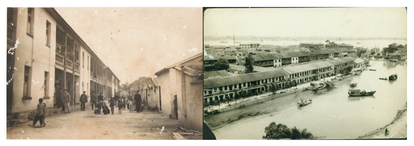
Fig 3. Left: Apartment blocks in the settlement site (1960s). Right: A harbor of the Sm Fishing Production Brigade (1960s).

However, as a result of a huge typhoon that hit the Jiulong River area in the summer of 1959, 132 lianjiachuan yumin drowned. 327 fishing vessels were also damaged in the catastrophe, and this became a turning point for lianjiachuan yumin to start acquiring property and houses on the land. To a large extent, this has also been the significance of the relief measures for the lianjiachuan yumin carried out by the local government. First, in 1960, the People's Government of Longxi County ordered an agricultural production team to offer cultivated land on the banks of the Jiulong River tributary, invested 140,000 yuan, and built two two-story wooden apartment blocks for the Sm (a fictitious name) Fishing Production Brigade of the Sm People's Commune, to which the lianjiachuan yumin belonged (Zhang, 2009:97-98). Subsequently, in addition to the collective housing, a net factory, shipbuilding factory, ice factory, fishery production factory, and a fishing port were built in the area. Additionally, lianjiachuan yumin who had not received collective housing also gathered in the ports of the various rural communities and berthed their ships, such that these places gradually began to function as bases for living and productive activities for more than 4,000 lianjiachuan yumin (Figure 3a, 3b).