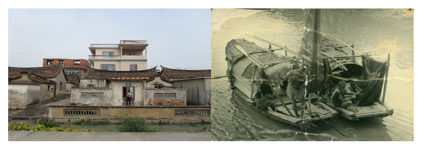
Fig 2. Left: Residence of rural village. Right: Lianjiachuan yumin (1950s). [Provided by Sm Fishing Shequ].

There has been a conflicted and strained relationship between the lianjiachuan yumin and the people living in the rural areas along the coast. For example, farmers have ridiculed the act of living on a ship without land or a house, and the physical characteristics arise as a result. They have referred to lianjiachuan yumin as chuandiren (船底人: people who sleep on boats), or shuiyazi (水鴨仔: ducks), or qutizi (曲蹄仔: bow-legged people). The lianjiachuan yumin have felt something akin to self-abasement in relation to the farmers, to the extent that a marriage between the two groups has been considered utterly unthinkable (Chen, 2007:592; Haidi, 2010: iii) (Figure 2a, 2b).